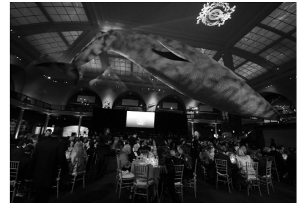
Milstein Hall of Ocean Life